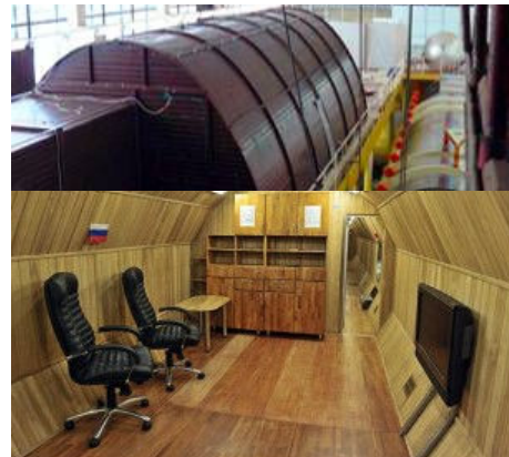
MARS 500 simulation of planetary mission

In the space domain, the plans for manned planetary missions set substantial challenges for providing crew support. There will be a need for a Mission Execution Crew Assistant (MECA) that supports groups of humans and machines acting in a distributed, autonomous but cooperative way. TNO, S&T, OK-Systems and EADS-Astrium are applying cognitive and software engineering methods to derive requirements and test prototypes for such a system.