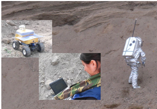
Evaluation of Crew Support during EVA